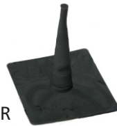
UTILITY COVER OVERLAY MARKER

Temporary markers are used during paving and sealing operations to mark lane lines and utility covers.